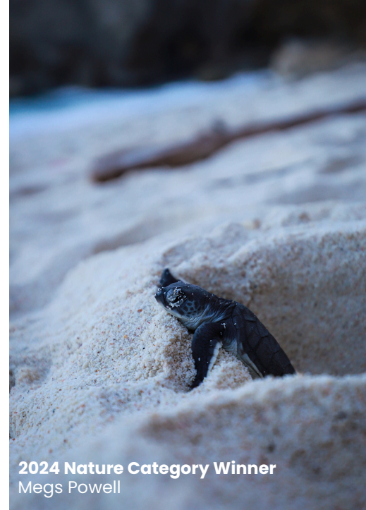
2024 Nature Category Winner Megs Powell