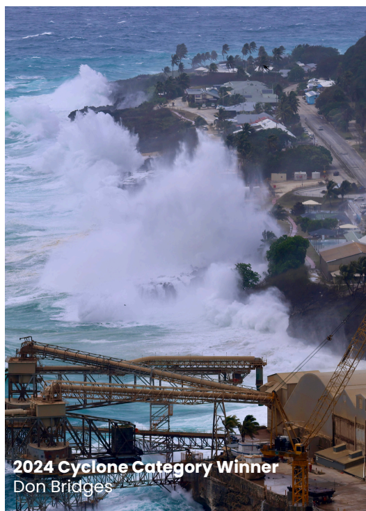
2024 Cyclone Category Winner Don Bridges

The top 40 photos will be selected to be displayed at the Territory Week Photo Exhibition at the CLA