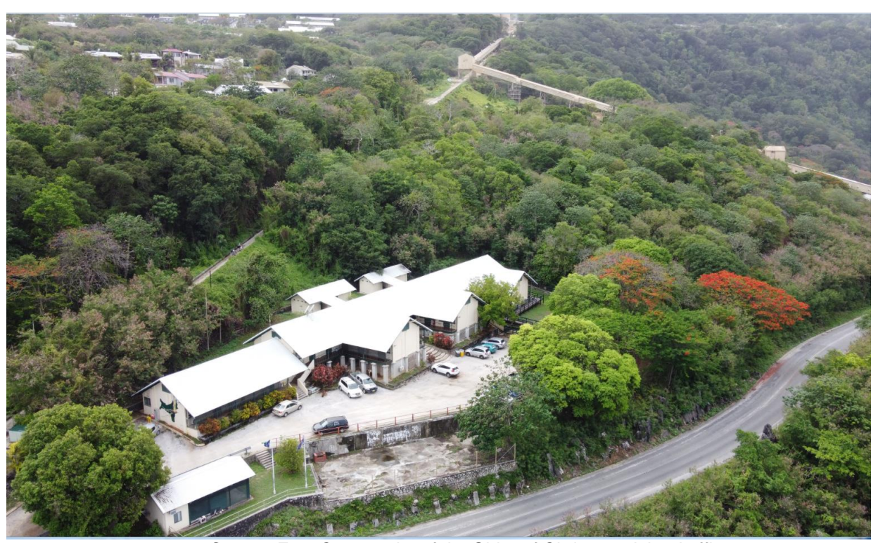
George Fam Centre, site of the Shire of Christmas Island offices